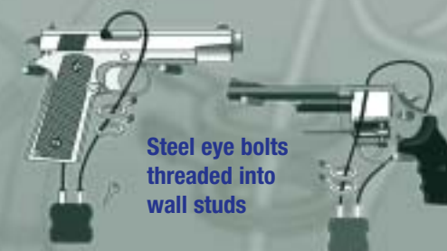
Steel eye bolts threaded into wall studs

Do not display the ammunition with the firearm. Keep it away from the firearm, in a place where it is not easy to obtain. If away from home, keep it in a securely locked container or room.