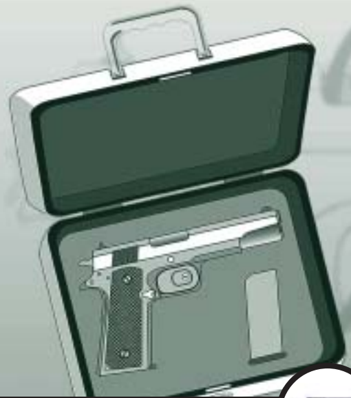
Restricted and Prohibited Firearms

These are the rules for individuals, as set out in the Storage, Display, Transportation and Handling of Firearms by Individuals Regulations.